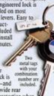
Two metal tags with your combination number are included.

Made of high-alloy, non-rusting, die-cast aluminum, and upholstered in soft, black leather-grain vinyl, The Hand Brake Lock improves your car's appearance because it looks better than the original equipment. To further assure you of quality, it has been tested and approved by the prestigious German Technical Inspection Board, TÜV. And, is